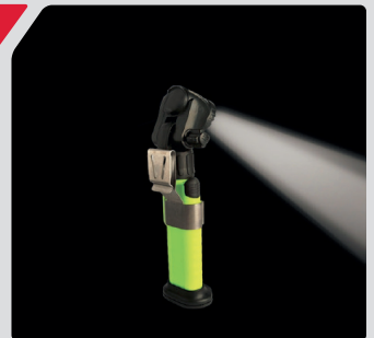
The shown metal clip must be purchased separately. The delivery always includes a Nylon Clip.